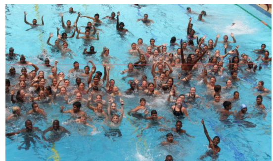
Swimmers at the 2011 CANA Zone 3 & 4 Swimming Championships, held in Botswana

"Being your best is not so much about overcoming the barriers other people place in front of you as it is about overcoming the barriers we place in front of ourselves. It has nothing to do with how many times you win or lose. It has no relation to where you finish in a race or whether you break world records. But it does have everything to do with having the vision to dream, the courage to recover from adversity and the determination never to be shifted from your goals." Kieren Perkins