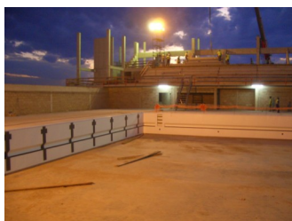
Maputo - Working around the clock to get the Swimming Pool ready for the All Africa Games

“The two 50m heated facilities will be one of the best swimming facilities on the continent.”